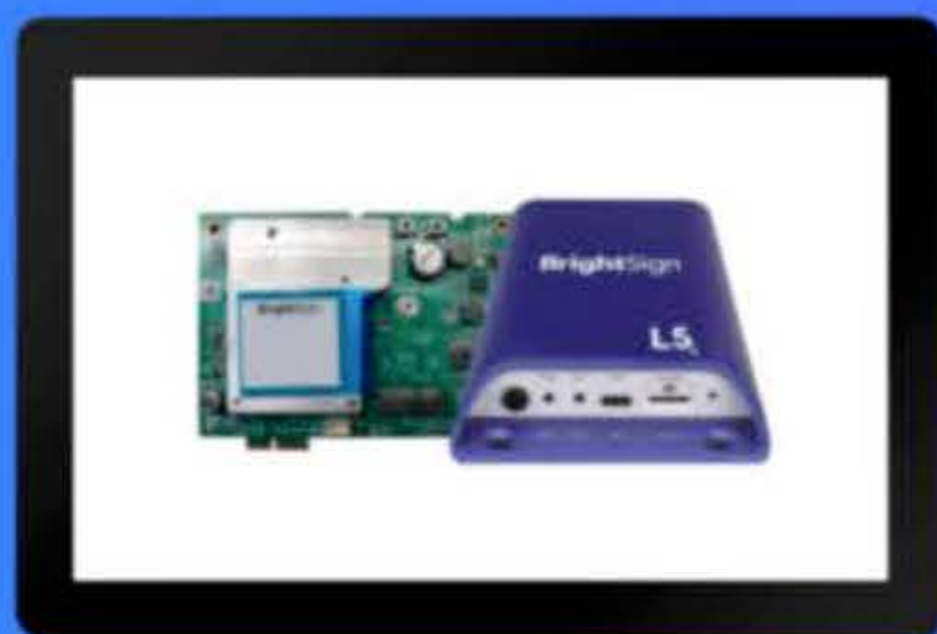
HS124 LS424 Equivalent 1920x1080p video and all basic BrightSign features.