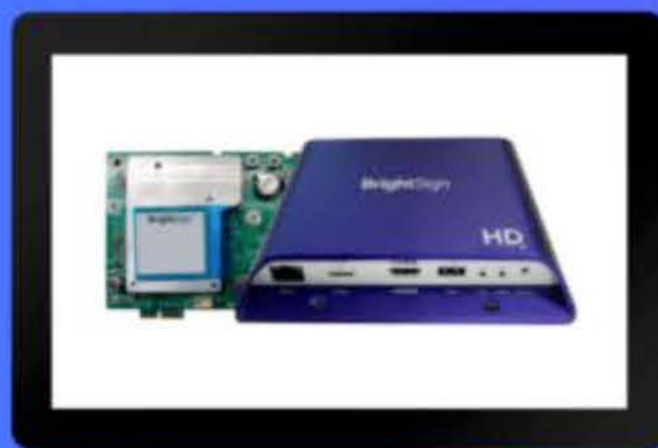
HS144 HD1024 Equivalent 4K video rendering, portrait mode presentations, higher HTML performance.