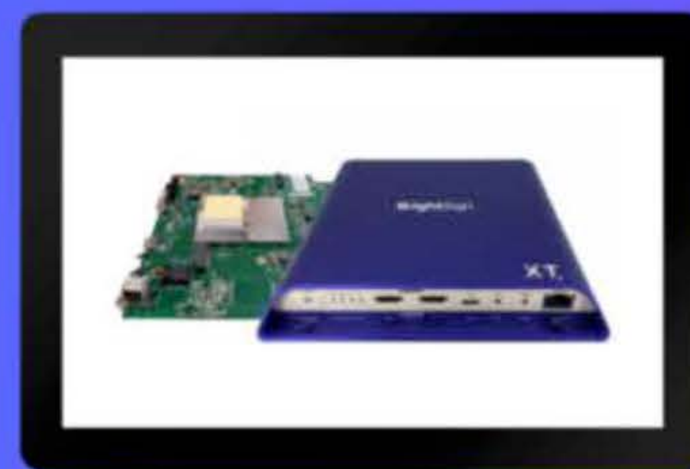
XT1144 BrightSign's most powerful player. Dual 4K video decoding and the highest available HTML performance. *I/O Unavailable.